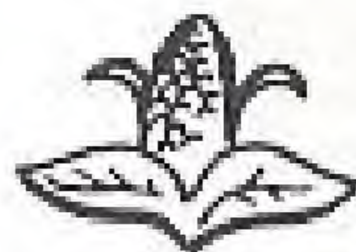
CORN OF ETERNAL YOUTH